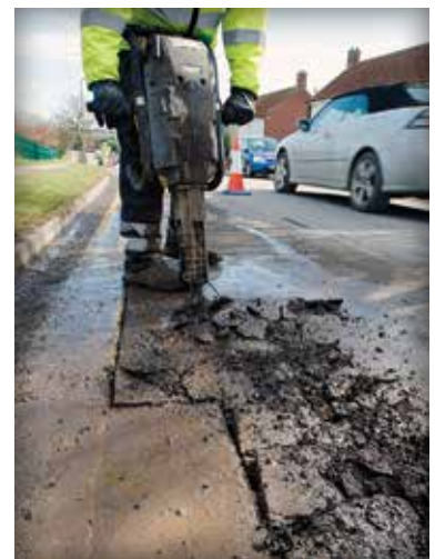
Figure 1. Repairs to utilities are a common sight in cities, incurring costs to cities and taxpayers.

The report concludes that while San Francisco has some of the highest standards for trench restoration, utility cuts produce damage that extends beyond the immediate trench. "...even the highest restoration standards do not remedy all the damage. Utility cuts cause the soil around the cut to be disturbed, cause the backfilled soil to be compacted to a different degree than the soil around the cut, and produce discontinuities in the soil and wearing