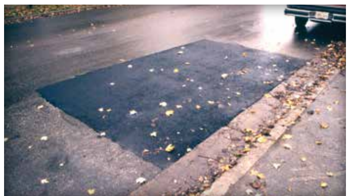
Figure 7. Pavement damage from settlement and shrinkage of cold patch asphalt.

Figures 2, 3, 4, 5 and 6 show the process of repair and illustrate the continuity of the paver surface after it is completed. The