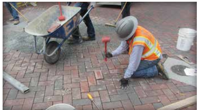
Figure 5. The final paver is inserted, the reinstated area compacted, joints filled, and compacted again. There are not cuts or damage to the pavement surface.