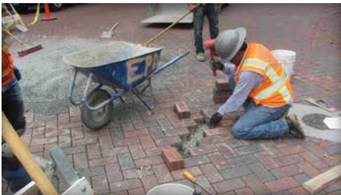
Figure 4. Reinstatement using the same pavers continues following the existing herringbone paving pattern.