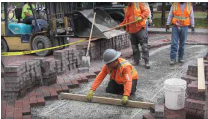
Figure 2. After compaction of the base, bedding material is screeded.

Pavement damage fees may be necessary for conventional, monolithic pavements (asphalt and cast-in-place concrete) be-