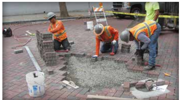
Figure 3. Once smoothed and joined with undisturbed materials at the opening perimeter, the bedding receives concrete pavers.