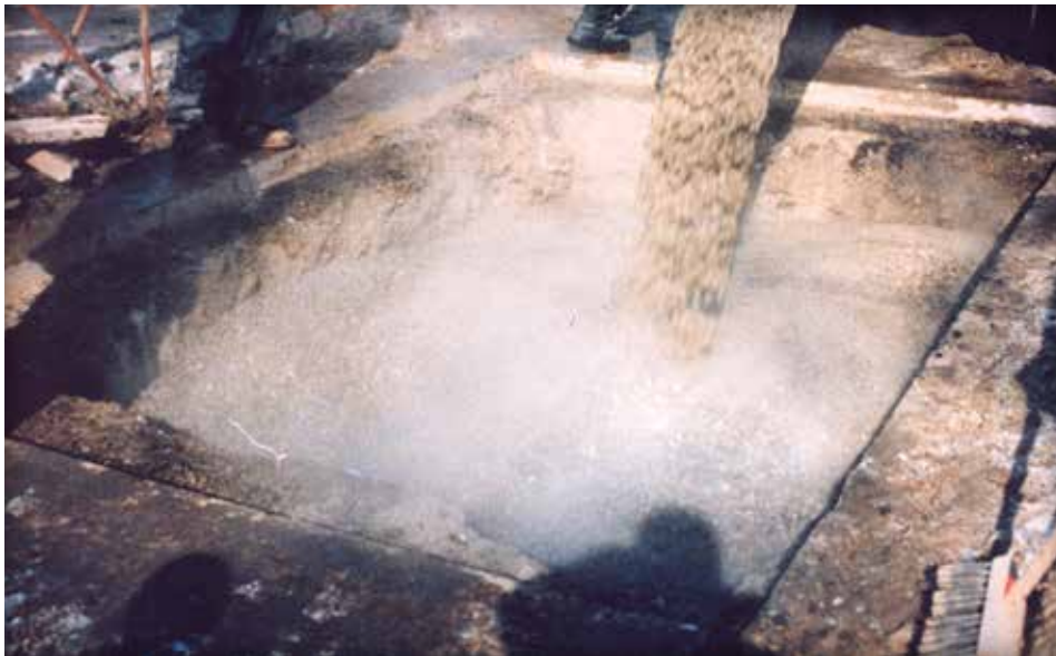
Figure 8. Low density concrete fill (unshrinkable fill) poured into a utility trench from a ready-mix concrete truck.

Unshrinkable fill poured into a trench is shown in Figure 8. The fill flows into undercuts providing additional support, and in places where the soil or base has fallen from the sides of the trench. These places are normally impossible to completely fill and compact with aggregate base or backfill material.