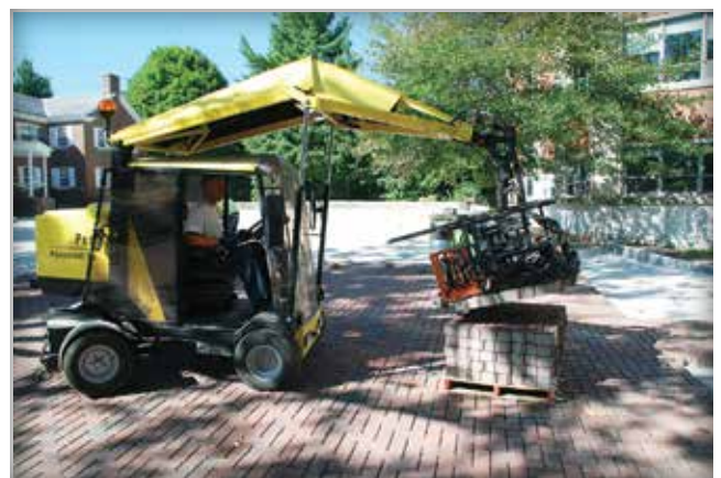
Figure 1. Mechanical installation of interlocking concrete pavements (left) and permeable units (right) is seeing increased use in industrial, port, and commercial paving projects to increase efficiency and safety.