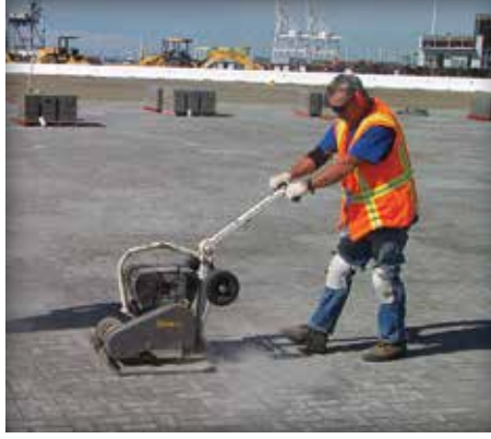
Figure 10. Initial compaction sets the concrete pavers into the bedding sand.