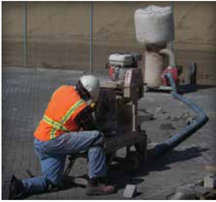
Figure 9. Edge pavers are saw cut to fit against a drainage inlet.