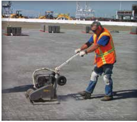
Figure 10. Initial compaction sets the concrete pavers into the bedding sand.