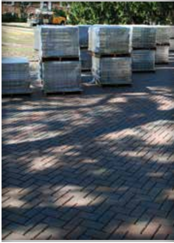
Figure 2. Bundles of ready-to-install pavers for setting by mechanical equipment. Bundles are often called cubes of pavers.

information on design and construction with this paving method. Other references include American Society for Testing and Materials or the Canadian Standards Association for the concrete pavers, sands, and joint stabilization materials, if specified. Placement of the base, drainage and related earthwork should be detailed in another specification section and may be performed by another subcontractor or the GC.