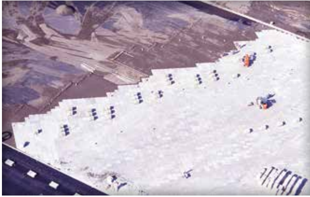
Figure 7. Maintaining an angular laying face that resembles a saw-tooth pattern facilitates installation of paver clusters.

Variations in the surface of the base must be repaired prior to installation of the bedding sand. The screeded bedding course should not be exposed to foot or vehicular traffic. Fill voids created by removal of screed rails or other equipment with sand as the bedding proceeds. The screeded bedding sand course should not be damaged prior to installation of the pavers. Types of damage can include saturation, displacement, segregation or consolidation. The sand may require replacement should these types of damage occur.