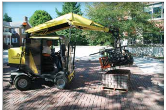
Figure 1. Mechanical installation of interlocking concrete pavements (left) and permeable units (right) is seeing increased use in industrial, port, and commercial paving projects to increase efficiency and safety.