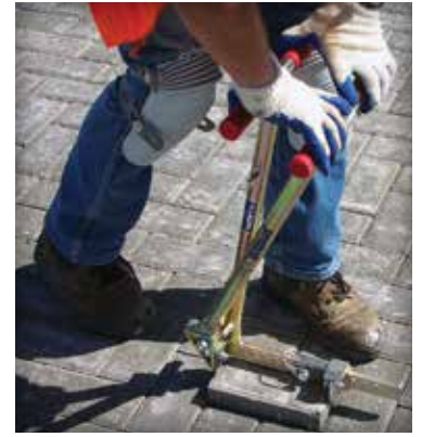
Figure 11. During initial compaction, cracked pavers are removed and immediately replaced with whole units.

Different laying and cluster patterns are shown in Figure 8. The need to maximize interlock among clusters with stitching depends on expected vehicular loads. For lower load applications, stitching may not be needed. In some cases stitching is done more for aesthetic reasons. For higher load applications, herringbone patterns or stitching clusters together may be required. The cluster configuration pattern and stitching (if required) should be illustrated in the method statement in the Quality Control Plan. As paving proceeds, hand install a string course of pavers around all obstructions such as concrete collars, catch basins/drains, utility boxes, foundations and slabs.