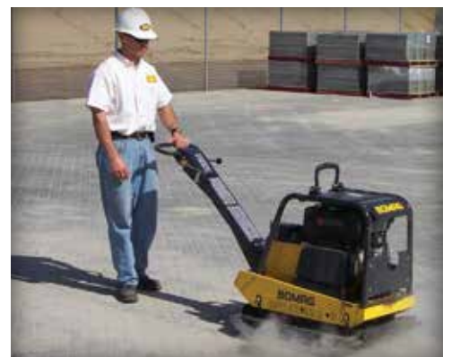
Figure 13. Final compaction should consolidate the sand in the joints of the concrete pavers.