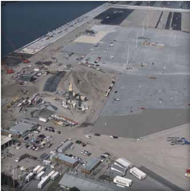
Figure 14. The Port of Oakland, California, is the largest mechanically installed project in the western hemisphere at 4.7 million sf (470,000 m 2 ).