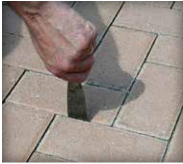
Figure 14. A simple test with a putty knife checks consolidation of the joint sand.

sweeping and vibration so it can enter the joints readily. Vibrate and fill joints with sand to within 6 ft. (2 m) of any unconfined edge at the end of each day.