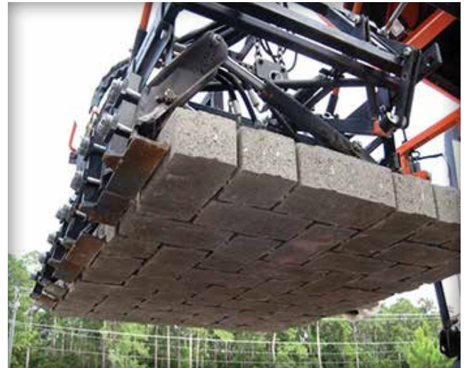
Figure 3. A cluster of pavers (or layer) is grabbed for placement by mechanical installation equipment. The pavers within the cluster are arranged in the final laying pattern as shown under the equipment.