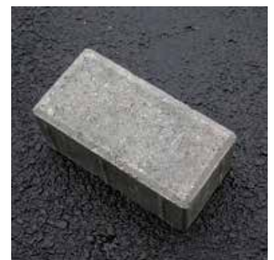
Figure 4. Spacer bars are small nibs on the sides of the pavers that provide a minimum joint spacing into which joint sand can enter.

A key aspect of this guide specification is dimensional tolerances of concrete pavers. For length and width tolerances, ASTM C 936 allows \pm 1/16 in. ( \pm 1.6 mm) and CSA A231.2 allows \pm 2 mm. These are intended for manual installation and should be reduced to \pm 1.0 mm (i.e., \pm 0.5 mm for each side of the paver) for mechanically installed pavers, excluding spacer bars. Height should not exceed