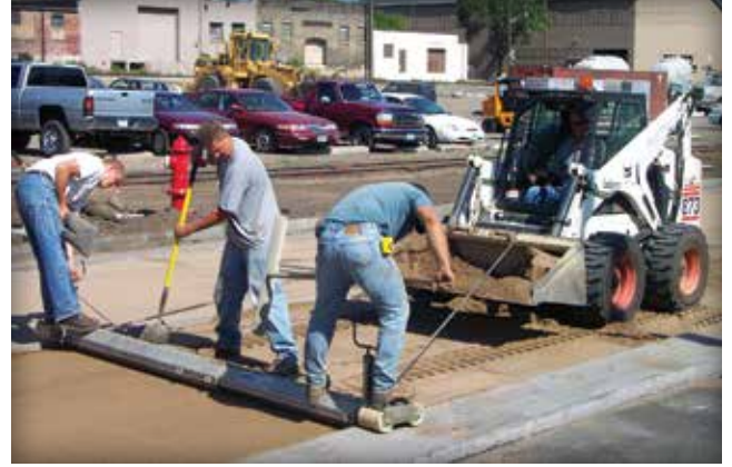
Figure 5. Mechanical screeding is the most efficient method of bedding sand installation

Role of Bedding Sand in Construction —Provided that the base was installed according to recommended construction practices and tolerances (See ICPI Tech Spec 2—Construction of Interlocking Concrete Pavements ), the bedding sand ensures that the pavers have a uniform slope and meet surface tolerances without surface undulations or “waviness.” Sand should be loosely screeded to a nominal thickness of 1 in. (25 mm) for vehicular applications. Screeds can either be pulled by hand or by machine (mechanical screed) as shown in Figures 4 and 5. Mechanical screeding provides the most efficient method. Pavers are placed on the loose uncompacted sand. Contractors should select sand that allows the pavers to be uniformly seated during their initial compaction with a minimum 4000 lb (18kN) force plate compactor.