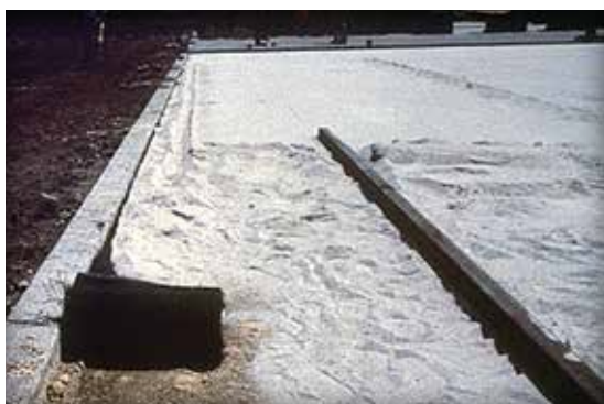
Figure 7. Woven geotextile used to contain bedding sand from migrating laterally. Visit www.icpi.org for detail drawings.

Interlocking concrete pavements should also be designed and constructed such that the bedding sand should not be able to migrate into the base, or laterally through the edge restraints. Dense-graded base aggregates with 5% to 12% fines (the amount passing the No. 200 or 0.075 mm sieve), will ensure that the bedding sand does not migrate down into the base surface. For pavements built over asphalt or