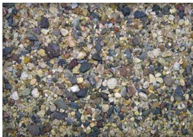
Figure 3. Example of sand from the ICPI bedding sand test program with a total combined percentage of sub-angular and sub-rounded particles equal to 65% according to ASTM D 2488

Recommended Material Properties —Table 3 lists the primary and secondary material properties that should be considered when selecting bedding sands for vehicular applications. Bedding sands may exceed the gradation requirement for the maximum amount passing the No. 200 (0.075 mm) sieve as long as the sand meets degradation and permeability recommendations in Table 3. Micro-Deval degradation testing can be replaced with sodium sulfate or magnesium soundness testing as long as this test is accompanied by the other primary material property tests listed in Table 3. Other material properties listed, such as petrography and angularity testing are at the discretion of the specifier and may offer additional insight into bedding sand performance.