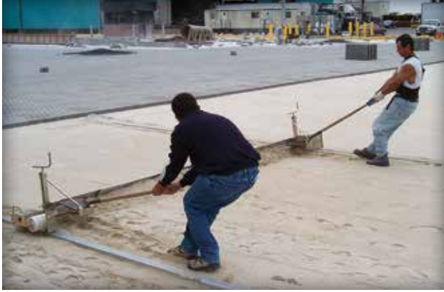
Figure 4. A two-man hand pulled screed