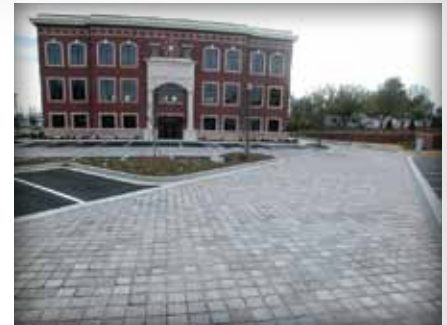
Runoff from the impervious asphalt surfaces is infiltrated into the PICP. The runoff is detained, filtered and infiltrated into the soil subgrade. Excess water is drained to storm sewers through perforated drain pipes in the base.