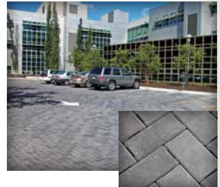
An 8,000 sf (743 m 2 ) entrance drop-off and parking lot creates a detention and infiltration for stormwater at the University of Victoria, British Columbia. The notched pavers and stone-filled joints infiltrate water from most commonly occurring storms.