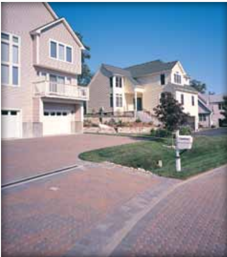
Runoff quantity and quality from driveways were monitored from water exiting slot drains.