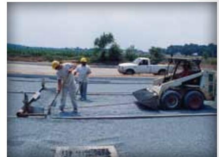
The bedding layer of No. 8 stone is screeded or smoothed to receive mechanically installed PICP.