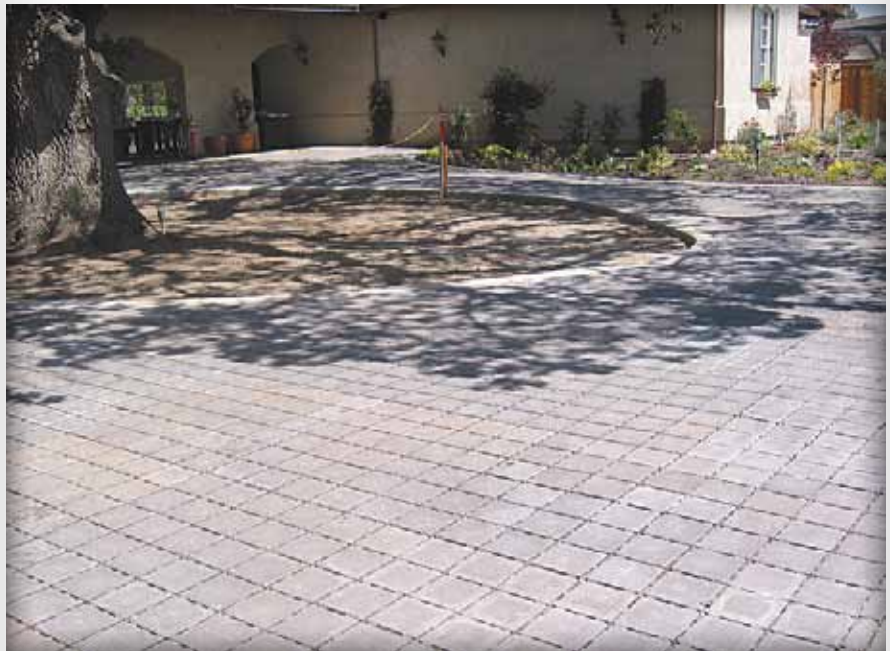
Roots feeding a 300 year-old oak tree receive additional air and water from permeable paving units at a landscape nursery in Livermore, California.