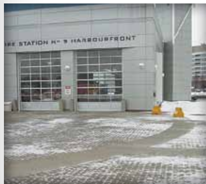
PICP withstands salt and snow plowing, a regular part of Toronto winters.

Adjacent to the Toronto SkyDome and the CN Tower in Toronto, this fire station uses PICP to reduce runoff pollutants entering nearby Lake Ontario.