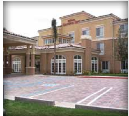
PICPs at this hotel in Southern California capture and treat the first flush from the parking lot. The curbs are recessed to allow overflows to run into an adjacent grass swale.