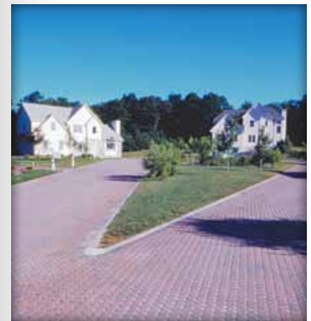
Rather than being paved, the center of the cul-de-sac in Glen Brook Green subdivision provides a bioswale to absorb runoff and overflow from the permeable pavement.