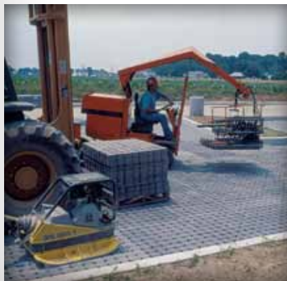
A clamp on specialized mechanical installation equipment grabs a layer of pavers for placement on the bedding. The pavers are compacted into the bedding layer, the openings and joints filled with the bedding material and compacted again to create interlock among the pavers. Since there is no curing, the pavers are immediately ready for traffic.