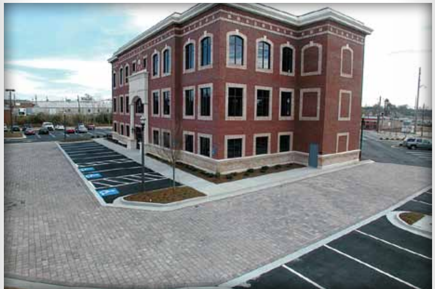
Even with low infiltration clay soil, permeable pavements manage runoff from typical rainstorms that fall on the parking lot at the Southern Heritage Building.