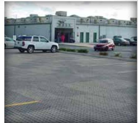
About 40,000 sf (3,716 m 2 ) of PICP eliminated the need for building detention pond when a parking lot was expanded behind a Wal-Mart shopping center.

General Contractor: A.P. Croll & Son Georgetown, Delaware