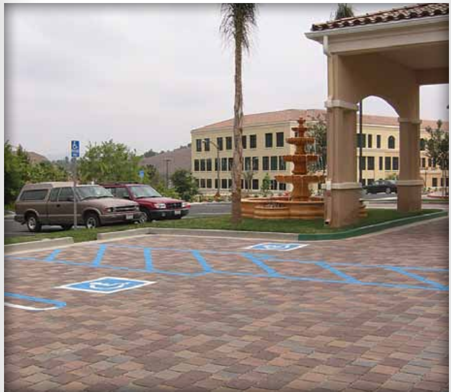
PICPs accommodate markings for parking spaces and an access route for disabled persons.