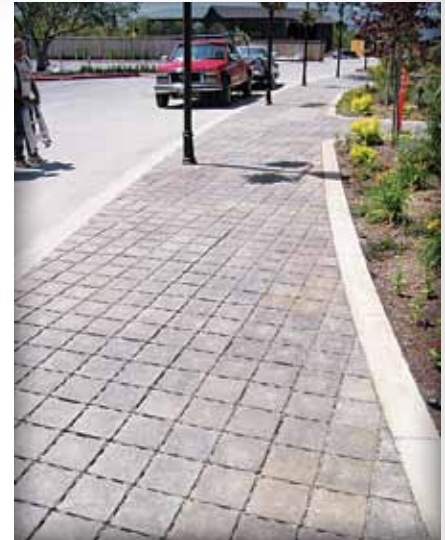
The sidewalk adjacent to the nursery entrance uses permeable paving units to return water to nearby vegetation.