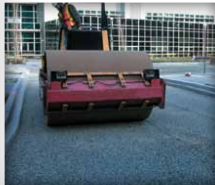
The project specifications called for crushed, open-graded base and sub-base compaction with initial passes of a roller compactor in vibratory mode, then final passes in static mode.