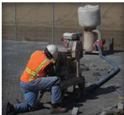
Figure 9. Edge pavers are saw cut to fit against a drainage inlet.