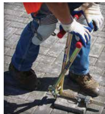
Figure 11. During initial compaction, cracked pavers are removed and immediately replaced with whole units.

with rubber hammers and alignment bars. Maximizing interlock among clusters and throughout the pavement surface is assisted by the placement pattern of the clusters. To help maximize the interlock between clusters, installations should avoid straight, continuous bond lines throughout the pavement surface. Rotating clamps on mechanical placement equipment facilitate easier clusters placement in patterns that do not create continuous joint lines.