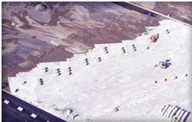
Figure 7. Maintaining an angular laying face that resembles a saw-tooth pattern facilitates installation of paver clusters.