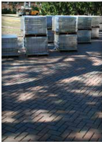
Figure 2. Bundles of ready-to-install pavers for setting by mechanical equipment. Bundles are often called cubes of pavers.

sand stabilization materials. ICPI Tech Spec 11–Mechanical Installation of Interlocking Concrete Pavements (ICPI 2015) should be consulted for additional information on design and construction with this paving method. Other references include American Society for Testing and Materials or the Canadian Standards Association for the concrete pavers, sands, and joint stabilization materials, if specified. Placement of the base, drainage and related