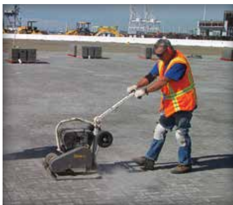
Figure 10. Initial compaction sets the concrete pavers into the bedding sand.