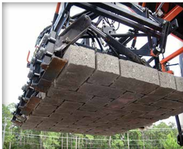
Figure 3. A cluster of pavers (or layer) is grabbed for placement by mechanical installation equipment. The pavers within the cluster are arranged in the final laying pattern as shown under the equipment.

A key component in the plan is a method statement by the manufacturer that demonstrates control of paver dimensional tolerances. This includes a plan for managing dimensional tolerances of the pavers and clusters so as to