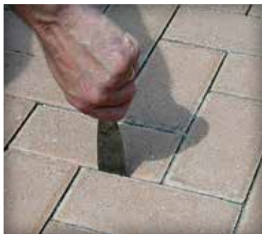
Figure 14. A simple test with a putty knife checks consolidation of the joint sand.

should note that some patterns cannot be changed because of the paver shape and some paver cuts will need to be less than one-third.