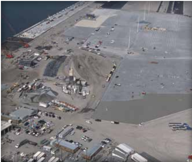
Figure 14. The Port of Oakland, California, is the largest mechanically installed project in the western hemisphere at 4.7 million sf (470,000 m 2 ).

The GC should insure that no vehicles other than those from the subcontractor's work are permitted on any pavers until completion of paving. This requires close coordination of vehicular traffic with other contractors working in the area. After the paver installation subcontractor moves to another area of a large site, or completes the job and leaves, he has no control over protection of the pavement. Therefore the GC should assume responsibility for protecting the completed work from damage, fuel or chemical spills. If there is damage, it should be repaired to its original condition, or as directed by the engineer. When the job is completed, all equipment, debris and other materials are removed from the pavement.