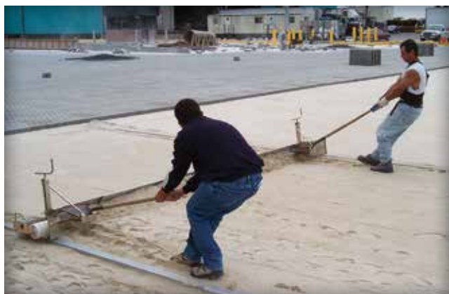
Figure 4. A two-man hand pulled screed