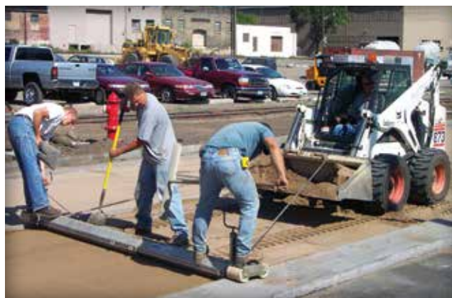
Figure 5. Mechanical screeding is the most efficient method of bedding sand installation

material properties listed, such as petrography and angularity testing are at the discretion of the specifier and may offer additional insight into bedding sand performance.