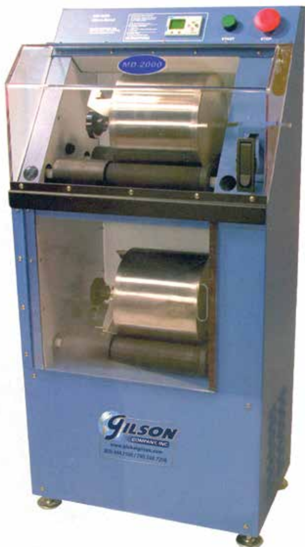
Figure 1. The Micro-Deval test apparatus.

The Micro-Deval test is evolving as the test method of choice for evaluating durability of aggregates in North America. Defined by CSA A23.2-23A, The Resistance of Fine Aggregate to Degradation by Abrasion in the Micro-Deval Apparatus and ASTM D7428 Standard Test Method for Resistance of Fine Aggregate to Degradation by Abrasion in the Micro-Deval Apparatus , the test method involves subjecting aggregates to abrasive action from steel balls in a laboratory rolling jar mill. In the CSA test method a 1.1 lb (500 g) representative sample is obtained after washing to remove the No. 200 (0.080 mm) material. The sample is saturated for 24 hours and placed in the Micro-Deval stainless steel jar with 2.75 lb (1250 g) of