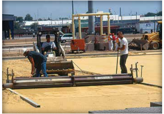
Figure 6a & 6b. Screeding the bedding sand.

mined by using the charts in ICPI Tech Spec 4—Structural Design of Interlocking Concrete Pavement for Roads and Parking Lots or ICPI Structural Design Software. This software is available for free download on www.icpi.org .