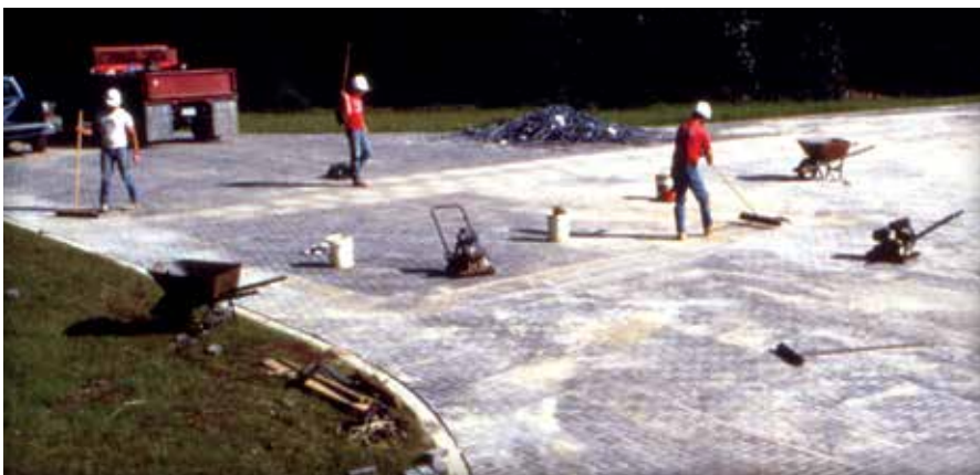
Figure 12. Removing excess sand from the finished surface will make the pavement ready for traffic.

Final surface elevations should not vary more than \pm\frac{3}{8} in. ( \pm 10 mm) under a 10 ft (3 m) straightedge, unless otherwise