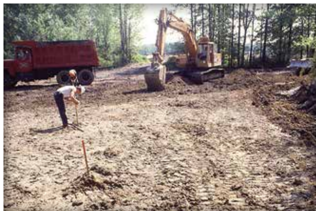
Figure 1. Excavation of the soil subgrade and placing grade stakes.

Installation steps include job planning, layout, excavating and compacting the soil subgrade, applying geotextiles (optional), spreading and compacting the sub-base and/or base aggregates, constructing edge restraints, placing and screeding the bedding sand, and placing concrete pavers. For larger installations mechanical placement of pavers may be more