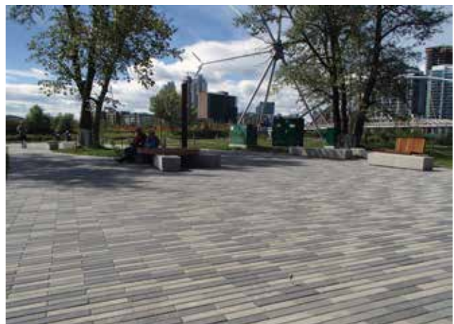
Figure 1. Concrete paving slabs can create certain moods and enhance the character of a project.