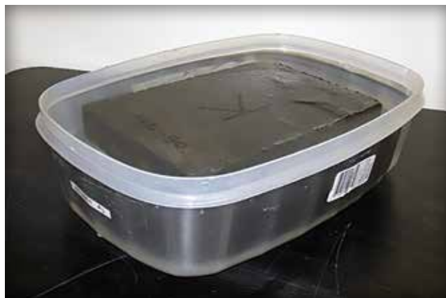
Figure 3. Test specimen from a slab immersed in a 3% saline solution ready for exposure to laboratory freeze-thaw cycles.

Segmental concrete paving slabs are sometimes mistakenly called concrete pavers or simply pavers. This has led to past misapplication of paving slabs in areas with substantial vehicular loads where interlocking concrete pavers should have been used. While concrete pavers and paving slabs are used in pedestrian applications, slabs are primarily for pedestrian use and limited vehicular traffic. Very large and thick slabs (called mega-slabs or large format paving units) have been used in some urban vehicular