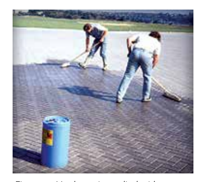
Figure 10. Urethane is applied with squeegees to stabilize joint sand between pavers on aircraft pavement.

worn during the job. With some sealers that recommend two coats, the first coat is usually applied to saturation. A light second coat, if needed, can be applied for a glossy finish. Be careful not to over apply the sealers such that the surface becomes slippery when cured. For water based sealers requiring two coats, always apply the second coat while the first coat is