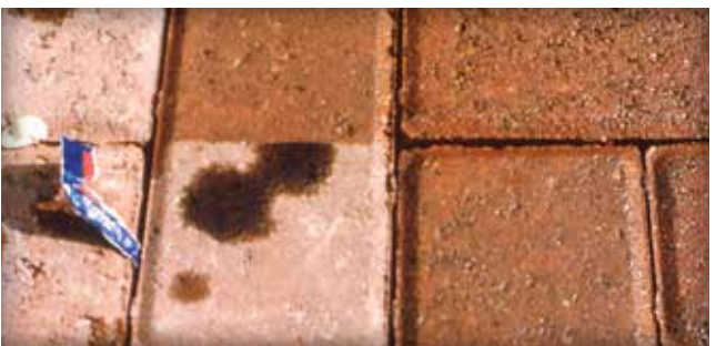
Figure 9. Sealers resist stains which makes them ideal for high use areas where they might occur.

Sealers reduce the intrusion of water, stains, oils and dirt into the paver surfaces. Like stabilizers, application of a sealer follows stain removal, efflorescence removal and overall surface cleaning. Sealers are used for visual and functional reasons. Sealers do not increase the structural properties of the paver nor do they impact the loading capacity of the paver system. They offer visual improvement by intensifying the paver colors. Some will add a glossy sheen or "wet" look to the pavement (see Figure 8). Other sealers offer some color enhancement and produce a low sheen, or a flat finish.