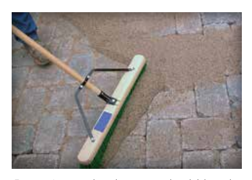
Figure 5. Joint sand can be pre-mixed and delivered to the site (typically in bags), or mixed with stabilizer at the site, then swept into the joints, compacted for consolidation in them to create interlock, and wetted to activate the stabilizer.

Given the wide range of joint sand stabilizers and proprietary formulations, it is best to consult with the manufacture to determine expected lifespan and/or reapplication rates.