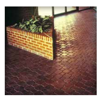
Figure 1. Many sealers enhance the appearance of concrete pavers and protect against staining.

Commercial stain removers available specifically for concrete pavers provide a high degree of certainty in removing stains. Many kinds of stains can be removed while minimizing the risk of discoloring or damaging the pavers. The container label often provides