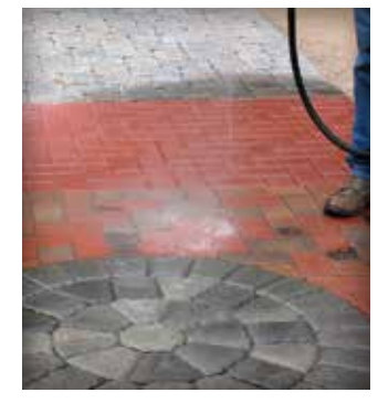
Figure 7. Dry-applied joint sand with a stabilizer is wetted in order to activate it and stiffen the sand. Once the joints dry, they are stabilized.

Tumbled pavers (cobble stone-like units) and circular patterns have wider joints than other paver shapes. Tumbled pavers may require stabilized joint sand between them if they have slightly irregular sides and wide joints.