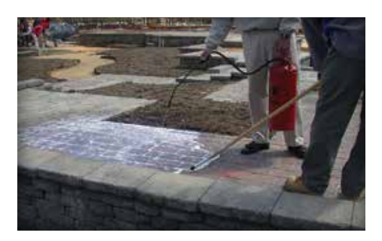
Figure 3. This liquid joint sand stabilizer is applied with a low-pressure sprayer and squeegeed across the surface after allowing some time for soaking into the joints. This helps maintain slip and skid resistance of the paver surface.