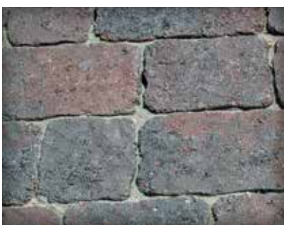
Figure 4. Liquid joint sand stabilizers can deepen the surface color slightly and they provide some surface sealing as well. Tumbled pavers shown here have wider joints than other shapes. These type of pavers can require stabilization of the joint sand.