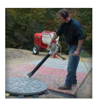
Figure 6. Whether using liquid or dry joint stabilization materials, the surface of the pavers should be cleaned with a blower or broom after the joint sand is compacted into the joints.

Stabilizers have been effective in securing joint sand in places subject to high winds such as in desert climates. They can prevent joint sand displacement from high-speed tire traffic. Like sealers, joint and stabilization materials reduce the potential for weeds and insects in the joints. In residential applications stabilization at downspouts and under eaves helps keep joint sand in place.