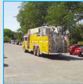
PICP is strong and durable.