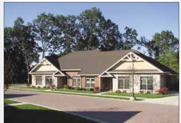
39,000 sf (3900 m 2 ) PICP street in Autumn Trails, Moline, IL eliminated the need for storm sewer inlets and pipes.