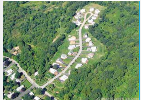
With no detention pond, layout conserves trees while 15,000 sf (1500 m 2 ) PICP in the cul-de-sac returns rainfall to the water table in Glen Brook Green subdivision in Waterford, CT.