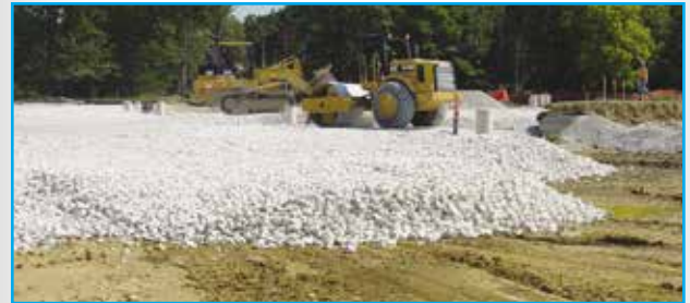
Base construction uses locally available materials.