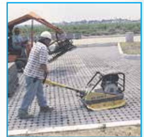
Mechanical installation speeds construction. Aggregate base and subbase are spread and compacted; pavers are delivered ready to install. After placement, joints and/or openings are filled with small aggregate and pavers compacted at this Walmart in Rehobeth Beach, DE.