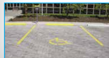
PICP complies with ADA, as shown in this university parking lot in Vancouver, BC.