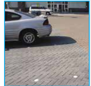
Stormwater treated in drive and parking space areas in Vancouver, BC shopping center.