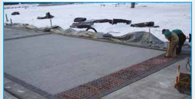
Installation can occur in freezing temperatures over unfrozen subgrade, shown here in Moline, IL.