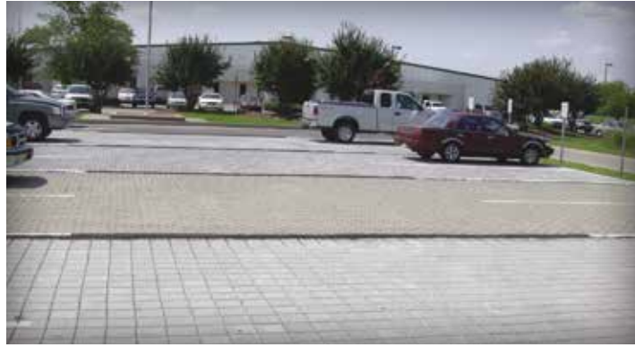
Multiple permeable pavement materials monitored by university students in Kinston, NC.