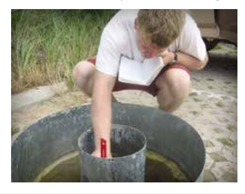
PICP parking lot at University of Victoria, Vancouver, BC treats stormwater and visually unifies the building entryway.