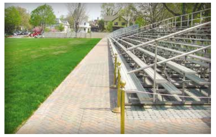
PICP under bleachers at the U.S. Naval Academy in Annapolis, MD provides structural support and on-site infiltration.