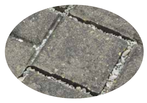
Permeable joint material consisting of small aggregates allows infiltration of stormwater.