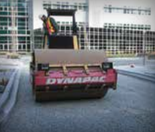
Base construction uses locally available materials. Pavers are delivered ready to place, joints filled, compacted and ready for traffic.