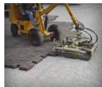
Mechanical installation equipment accelerates construction; typical 5,000 sf (500 m^2 )/machine/day. After placement, joints and/or openings filled with small aggregate and pavers are compacted.