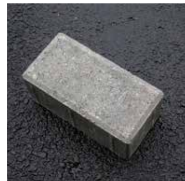
Figure 4. Spacer bars are small nibs on the sides of the pavers that provide a minimum joint spacing into which joint sand can enter.

The ASTM and CSA freeze-thaw deicing salt tests for freeze-thaw durability requires several months to conduct. Often the time between manufacture and time of delivery to the site is a matter of weeks or even days. In such cases, the engineer may consider reviewing freeze-thaw deicing salt test results from pavers made for other projects with the same mix design. These test results can be used to demonstrate that the manufacturer can meet the freeze-thaw durability requirements in ASTM C936 and CSA A231.2. Once this requirement is met, the engineer should consider