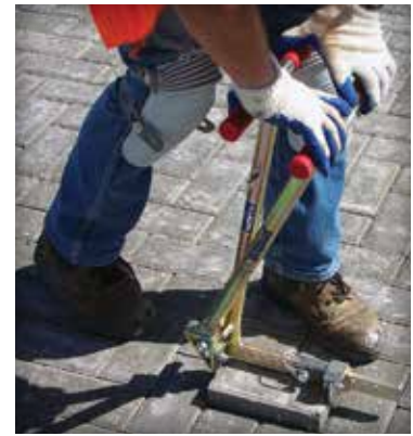
Figure 11. During initial compaction, cracked pavers are removed and immediately replaced with whole units.

with rubber hammers and alignment bars. Maximizing interlock among clusters and throughout the pavement surface is assisted by the placement pattern of the clusters. To help maximize the interlock between clusters, installations should avoid straight, continuous bond lines throughout the pavement surface. Rotating clamps on mechanical placement equipment facilitate easier clusters placement in patterns that do not create continuous joint lines.