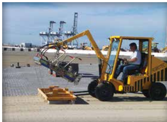
Figure 12. Sweeping jointing sand across the pavers is done after the initial compaction of the concrete pavers.

Whenever possible cut pavers exposed to tire traffic should be no smaller than one-third of a full paver and all cut pavers should be placed in the laying pattern to provide a full and complete paver placement prior to initial compaction. Coursing can be modified along the edges to accommodate cut pavers. Joint lines are straightened and brought into conformance with this specification as laying proceeds and prior to initial compaction. Sometimes the pattern may need to be changed to ensure that this can be achieved. However, specifiers