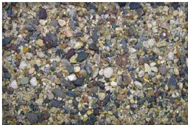
Figure 3. Example of sand from the ICPI bedding sand test program with a total combined percentage of sub-angular and sub-rounded particles equal to 65% according to ASTM D2488

Recommended Material Properties —Table 3 lists the primary and secondary material properties that should be considered when selecting bedding sands for vehicular applications. Bedding sands may exceed the gradation requirement for the maximum amount passing the No. 200 (0.075 mm) sieve as long as the sand meets degradation and permeability recommendations in Table 3. Micro-Deval degradation testing can be replaced with sodium sulfate or magnesium soundness testing as long as this test is accompanied by the other primary material property tests listed in Table 3. Other