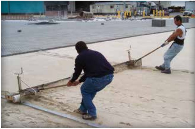
Figure 4. A two-man hand pulled screed