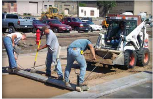
Figure 5. Mechanical screeding is the most efficient method of bedding sand installation

material properties listed, such as petrography and angularity testing are at the discretion of the specifier and may offer additional insight into bedding sand performance.