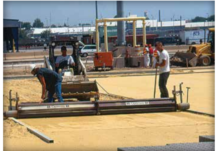
Figure 6a & 6b. Screeding the bedding sand.

mined by using the charts in ICPI Tech Spec 4—Structural Design of Interlocking Concrete Pavement for Roads and Parking Lots or ICPI Structural Design Software . This software is available for free download on www.icpi.org .