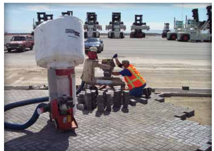
Figure 8. Saw cutting pavers.