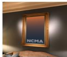
#3 (a,b) Mirror 30-5/8 x 58-1/2"