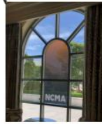
#2 (a,b,c) Windows Top 33 x 26-1/4 Bottom 33 x 26-1/4