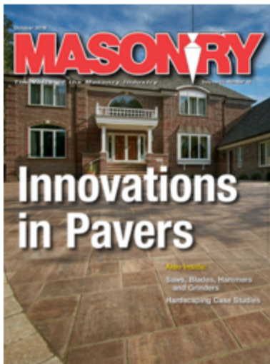
Image 1: The October 2016 issue of Masonry Magazine features concrete pavers manufactured by County Materials Corporation in this award winning residence.