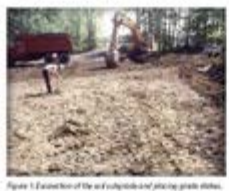
Figure 1. Execution of the wet mix process and placing grade above.