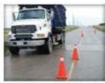
Figure 2. The pavement test track at the Waterloo Regional Works Facility experiences heavy traffic almost exclusively from heavy trucks.