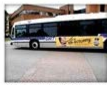
Figure 1. Crosswalks were installed on King Road at the University of Waterloo. These are urban roads that have high and heavy automobile traffic.