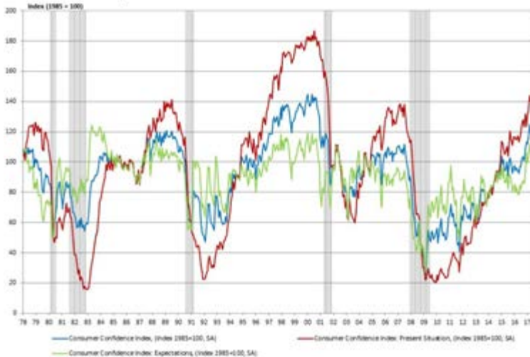
Figure 1. Conference Board - Consumer Confidence Index

The Consumer Confidence Index, released by the Conference Board, rose in June. Consumers were quite optimistic about current conditions, but less optimistic about the near term outlook than in May. READ MORE