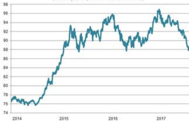
Trade-Weighted U.S. Dollar Index Against Major Currencies, 2014–2017 (Currency Units per U.S. Dollar, 1973=100)

The IHS Markit Canada Manufacturing PMI increased from 54.7 in June to 55.5 in July, its best reading since April's six-year high. The pace of new orders matched the index in March, with both at levels last seen in October 2014. That would seem to indicate that the Canadian manufacturing sector has begun to recover from challenges across the past two years. Real GDP in Canada grew 0.9 percent in the first quarter, picking up from the 0.7 percent gain in the fourth quarter. That translated into 3.7 percent growth at the annual rate in the first quarter, with both consumer and business spending boosting the Canadian economy. In addition, manufacturing sales and retail spending saw healthy gains in May and in year-over-year data. Meanwhile, the unemployment rate declined to 6.3 percent in July, its lowest level since October 2008, and manufacturers added 13,700 workers in July, with year-over-year growth of 53,000 employees. READ MORE