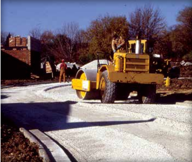
Figure 4. Base compaction with a vibratory roller.

When the fabric is placed in the excavated area, it should be turned up along the sides of the opening, covering the sides of the base layer. There should be no wrinkles on the bottom. When the aggregate is dumped on the fabric, the tires of trucks should be kept off the fabric to prevent wrinkling.