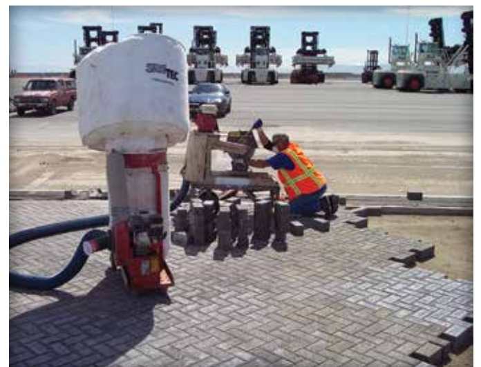
Figure 8. Saw cutting pavers.