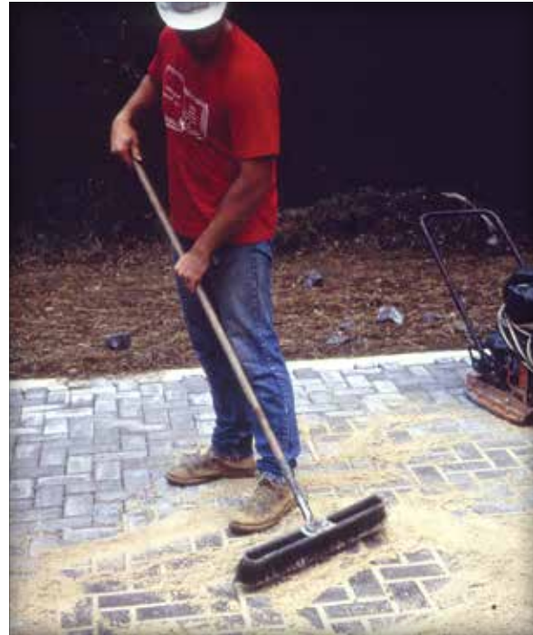
Figure 10. Spreading and sweeping joint sand.

catch basins. These areas should be covered with a geotextile fabric to prevent loss of the bedding sand.