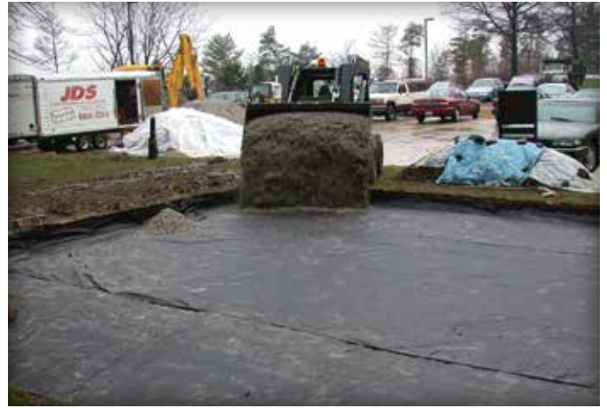
Figure 3. Application of the geotextile under aggregate base.