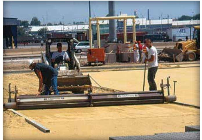
Figure 6a & 6b. Screeding the bedding sand.

determined by assessing the traffic loads, soils, and environmental factors (e.g., drainage, freeze-thaw). The layer coefficient recommended for 3\frac{1}{8} in. (80 mm) thick pavers on 1 in. (25 mm) bedding sand is 0.44 per inch (25 mm), i.e., the SN = 4\frac{1}{8} \times 0.44 = 1.82 . Base thicknesses can be readily determined by using the charts in ICPI Tech Spec 4—Structural Design of Interlocking Concrete Pavement for Roads and Parking Lots or ICPI Structural Design Software. This software is available for free download on www.icpi.org .