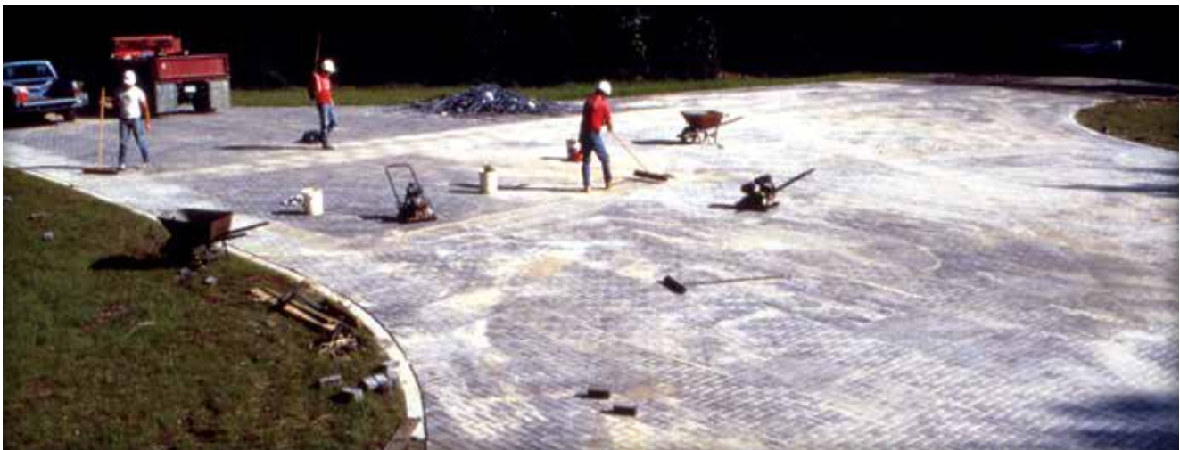
Figure 12. Excess sand swept from the finished surface will make the pavement ready for traffic.

Dry joint sand is swept into the joints and the pavers compacted again until the joints are full. See Figures 10 and 11. This may require two or three passes of the plate compactor. If the sand is wet, it should be spread to dry on the pavers before being swept and compacted into the joints. Joint sand may be finer than the bedding sand to facilitate filling of the joints. Bedding sand also can be used to fill the joints, but it may require extra effort in sweeping and compacting. Compaction should be within 6 ft (2 m) of an unrestrained edge or laying face. All pavers within 6 ft (2 m) of the laying face should have the joints filled and be compacted at the end of each day. Excess sand is then removed. See Figure 12. The remaining uncompacted edge can be covered with a waterproof covering if there is a threat of rain. This will prevent saturation of the bedding sand, minimizing removal and replacement of the bedding sand and pavers.