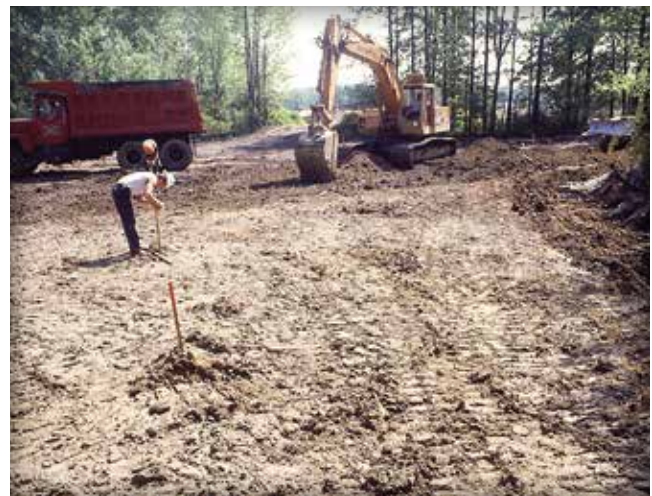
Figure 1. Excavation of the soil subgrade and placing grade stakes.

Installation steps include job planning, layout, excavating and compacting the soil subgrade, applying geotextiles (optional), spreading and compacting the sub-base and/or base aggregates, constructing edge restraints, placing and screeding the bedding sand, and placing concrete pavers. For larger installations mechanical placement of pavers may be more economical. Refer to Tech Spec 11—Mechanical Installation of Interlocking Concrete Pavements for additional information.