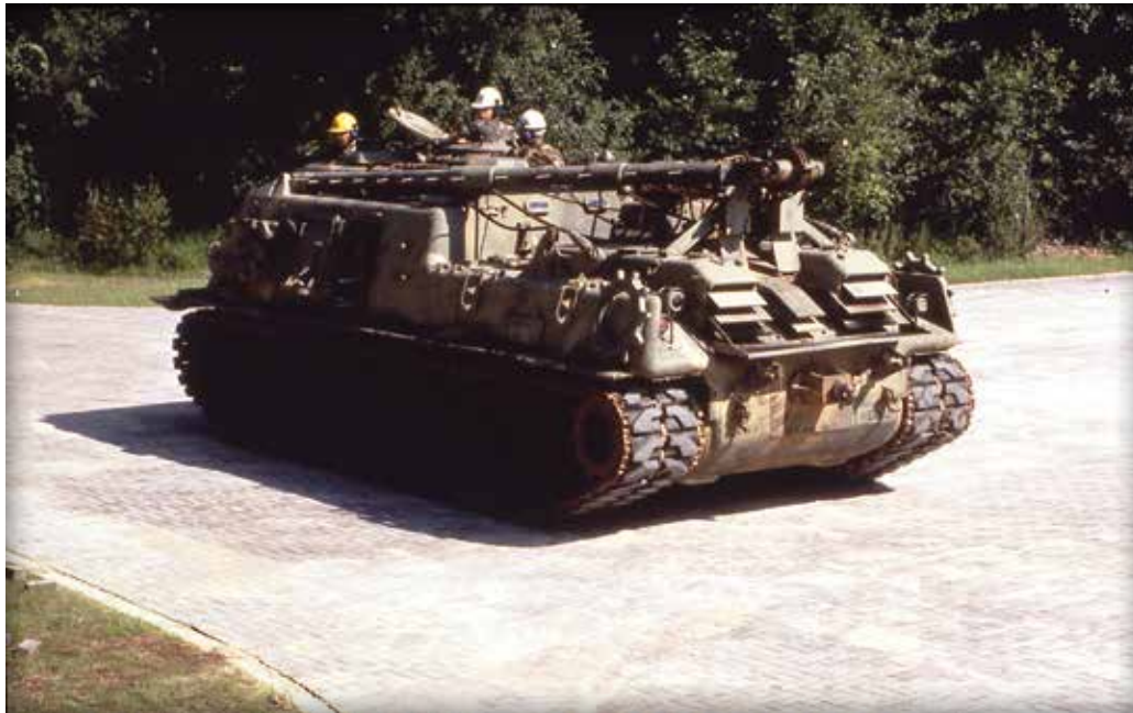
Figure 13. The completed paved area from Figure 12 receives tank traffic at the U.S. Army Proving Grounds in Aberdeen, Maryland.

Final surface elevations should not vary more than \pm 3/8 in. ( \pm 10 mm) under a 10 ft (3 m) straightedge, unless otherwise specified. Bond or joint lines should not vary \pm 1/2 in. (13 mm) over 50 ft (15 m) from taut string lines. The top of the pavers should be 1/8 to 3/8 in. (3 to 10 mm) above adjacent catch basins, utility covers, or drain channels, with the exception of areas required to meet ADA design guideline tolerances. The top of the installed pavers may be 1/8 to 1/4 in. (3 to 6 mm) above the final elevations to compensate for possible minor settling. A small amount of settling is typical of all flexible pavements. Optional sealers or joint sand stabilizers may be applied. Using stabilized sand may have advantages in areas prone to joint sand loss. See ICPI Tech Spec 5—Cleaning, Sealing and Joint Sand Stabilization of Interlocking Concrete Pavement for further guidance.