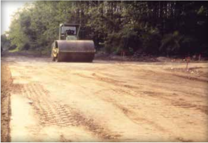
Figure 2. Compacting the soil subgrade.