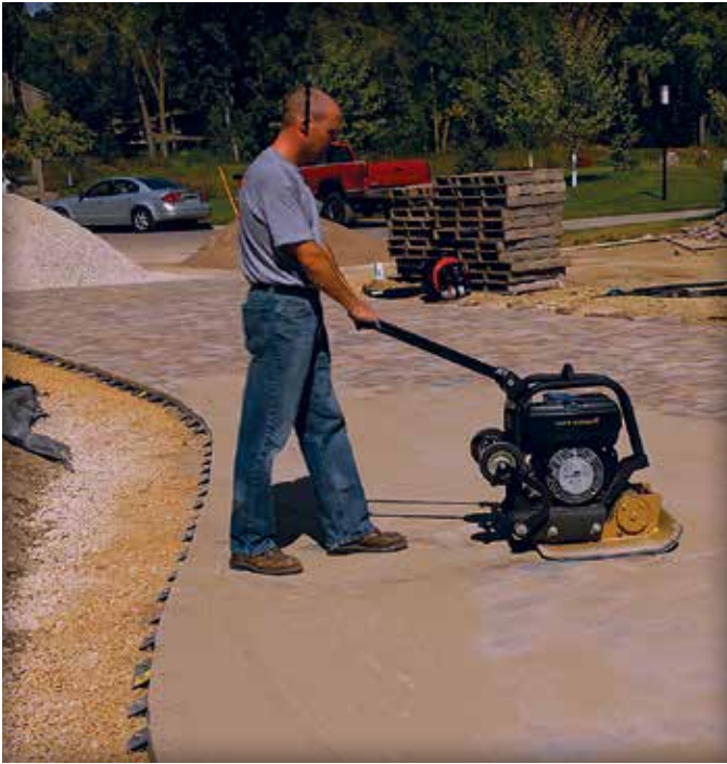
Figure 11. Vibrating sand into the joints.

performance. Certain manufacturers may have materials and data that discuss the potential benefits of shapes on functional and structural performance in vehicular applications. Chalk lines snapped on the bedding sand or string lines pulled across the surface of the pavers are used as a guide to maintain straight joint lines. Buildings, concrete collars, inlets, etc., are generally not straight and should not be used for establishing straight joint lines.