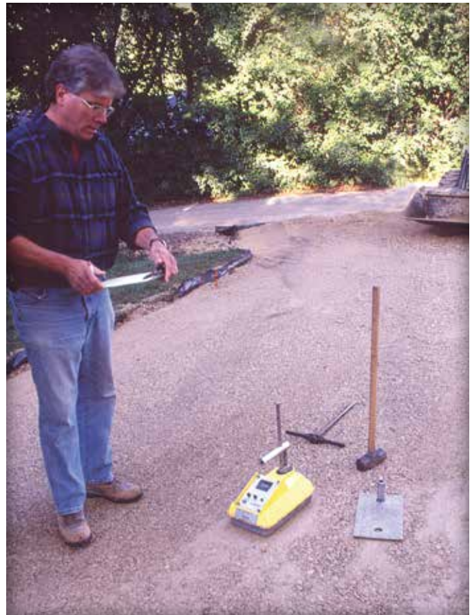
Figure 5. Density testing of the aggregate base with a nuclear density gauge.

Many localities determine base thickness with the 1993 Guide for the Design of Pavement Structures published by the American Association of State Highway and Transportation Officials (AASHTO). The AASHTO procedure calculates the structural number (SN) of the strength coefficients of each base and pavement layer. The SN is