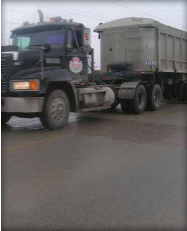
Figure 13. Crosswalk in use under heavy traffic.