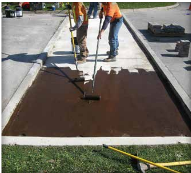
Figure 2. Emulsified asphalt tack coat is applied to a concrete base prior to applying the bitumen-sand mix.

Figures 2 through 12 demonstrate the bitumen-sand set interlocking concrete pavement installation sequence for a crosswalk. Once the concrete base is in place and cured