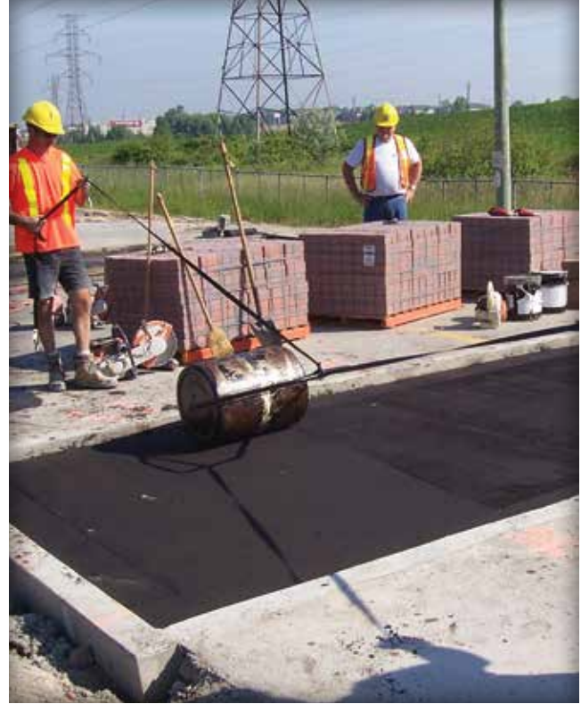
Figure 14. A water-filled roller compactor for compacting the bitumen-sand bedding.

practically impossible because the bitumen-sand material adheres to the bottom of the pavers when removed. It is less expensive to discard the pavers rather than remove the asphalt from the units and attempt to reinstate them.