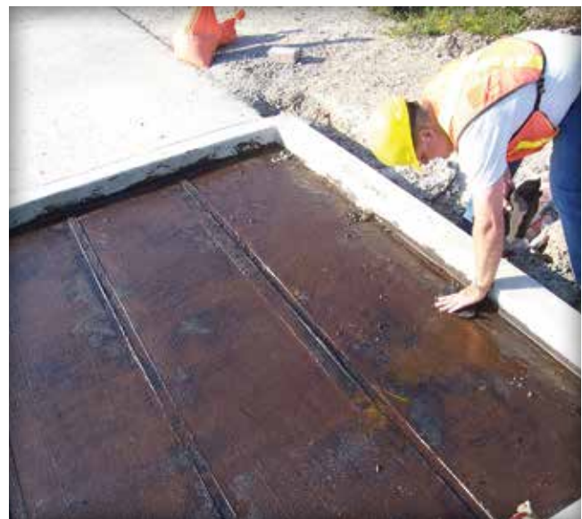
Figure 3. Confirming the tack coat has cured and is no longer wet to the touch.

Best application results are typically achieved using a synthetic paint roller with a short nap. Once applied the tack coat should not be disturbed and should be allowed to cure before covering with the setting bed material. As the asphalt emulsion cures it should turn from a brown to black color (Figure 3). This may take a few hours depending on weather conditions. When using SS-1 and SS-1h asphalt emulsions the temperature should be between 70 and 160° F (20 to 70° C) to allow for proper curing. Asphalt tack coats are recommended for vehicular applications. They are typically not required in pedestrian applications.